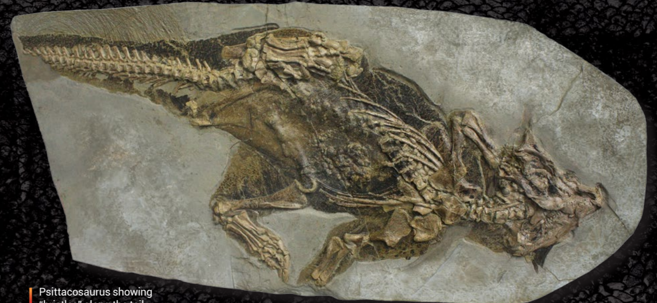
Psittacosaurus showing "bristles" along the tail.

In fact, these quills probably evolved later into their massive armour and spikes, like the primitive armoured dinosaur Scelidosaurus shows.